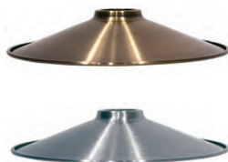
Cone Shade - small (7-7/8" Dia.)